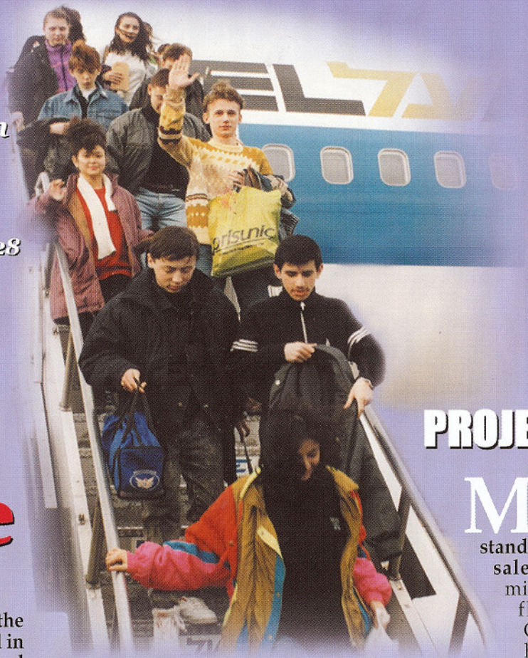
Regathering to their own Land

During the Gulf War of 1991, the Lord opened the doors for CFI to begin a unique work among His people. To our knowledge, since the founding of the State of Israel this type of work had not before been accomplished by Christians. The enormous task of immigration has been a great drain on the economy of the nation. Since our doors opened at the CFI Distribution Center for Russian Jewry and those from other oppressed lands, the Center has been a special and inspirational place for Jews from all over Israel to receive help in their first days of returning home.