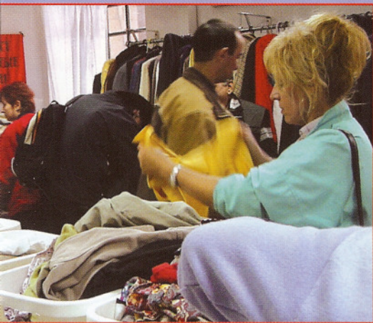
ing blessings from the nations