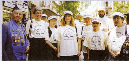
War veteran event march

Another area of outreach touches elderly Jewish Russian war veterans. CFI holds a program twice a year in their honor. God's love is showered upon this group of people, and expressed through singing, the reading of Scripture verses and speeches. Their responses to CFI affirm their need to be remembered. Often hot, worn out and thirsty, they arrive at our front gate. When the veterans leave they ask us, "When is the next event?"