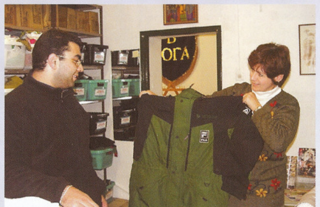
Warm jacket brings smiles

One hundred percent of all designated gifts are placed in each project fund for distribution to the poor and needy who come to our D.C.