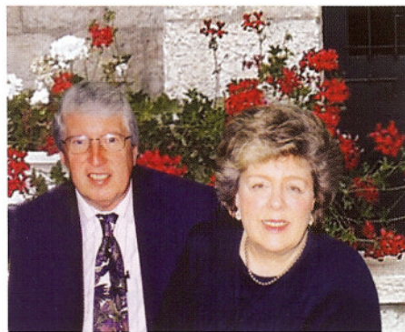
"...I have chosen you, and ordained you, that ye should go and bring forth fruit..." (John 15:16)

CFI Jerusalem, along with our Representatives in the nations, has a special call to teach the Church her connection to her Jewish roots. At CFI, we believe that the Lord Jesus is both Messiah of Israel and Savior of the world; however, our stand alongside the Jewish people is not conditional.