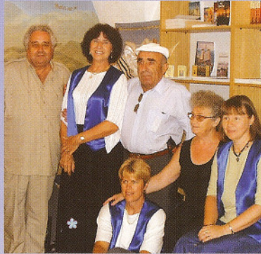
Holocaust Team comforting Survivors

The CFI Holocaust Team represents the nations of Canada, England, Finland, the United States, Switzerland, the Netherlands and Russia. They minister to Jewish Holocaust survivors who are the last voices from the ghettos and the death camps. The sounds of cattle cars pulling away from train stations echo fearful voices of loved ones. The stench of the crematoriums fills their nostrils. Scenes of dead bodies continue to haunt their memories.