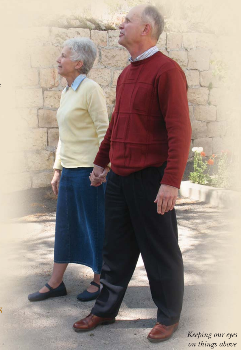
Keeping our eyes on things above

What could be a better use of our finances than to bless Israel?